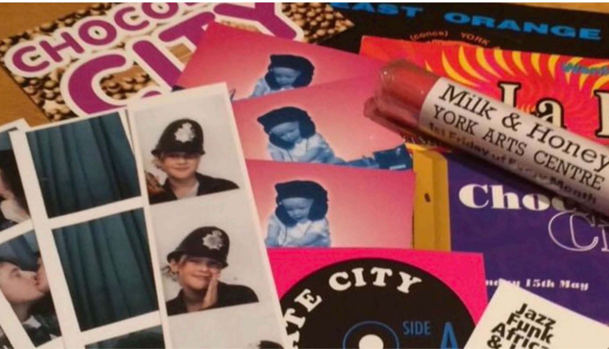
Image of East Orange and other LGBT club flyers