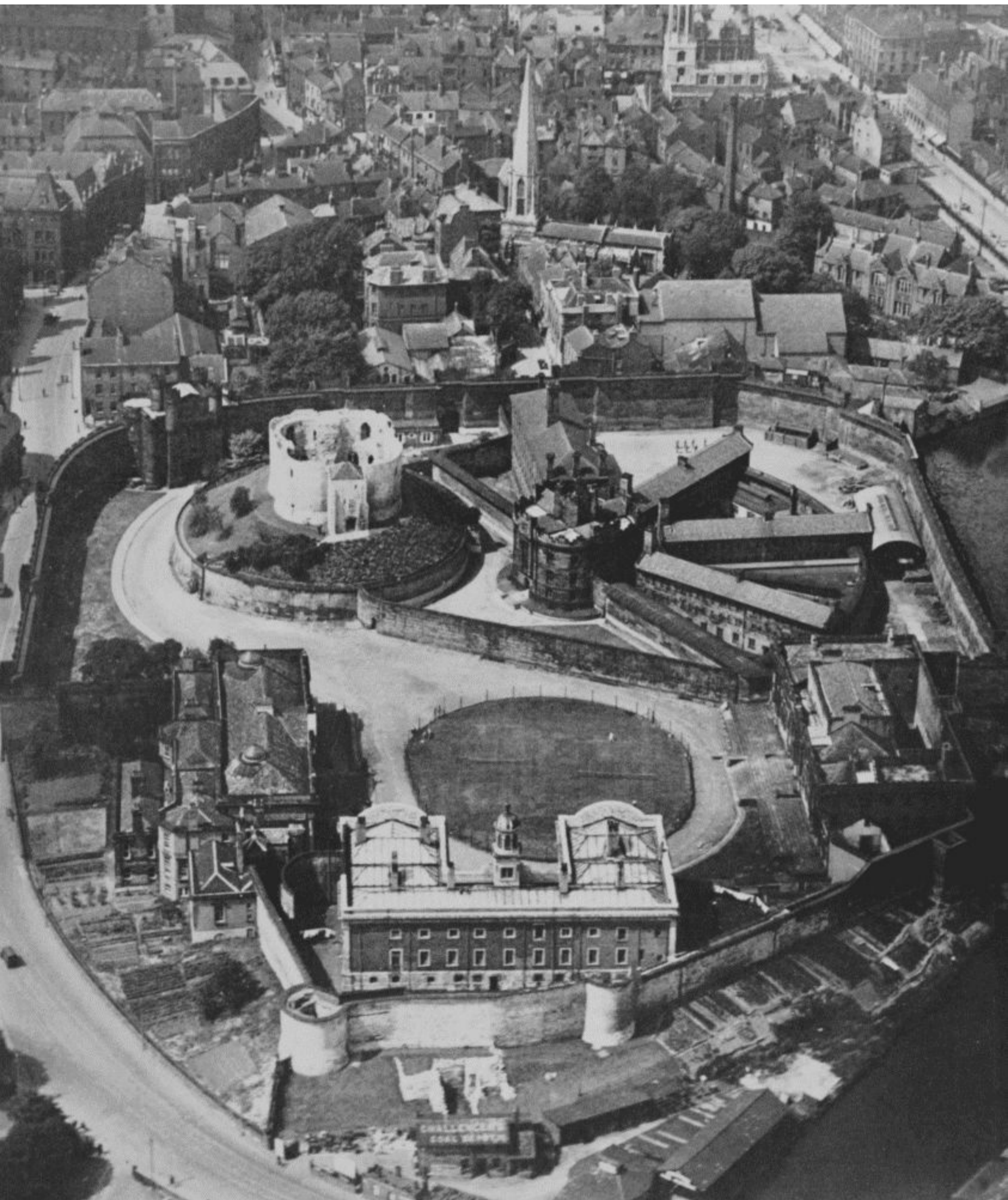
Arial Photo of York Prison Arial Photo of York Prison