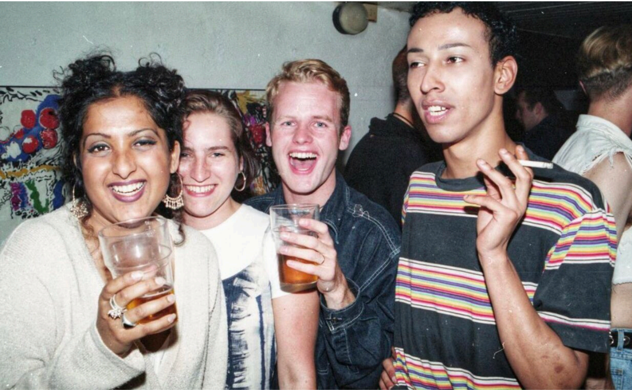
Inside East Orange